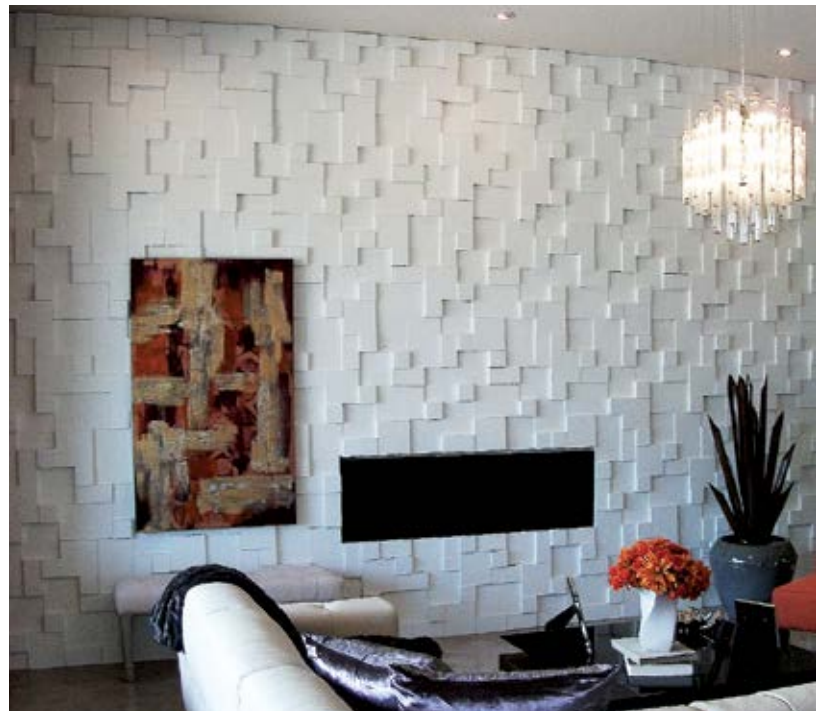
Lennox Stone - Painted White