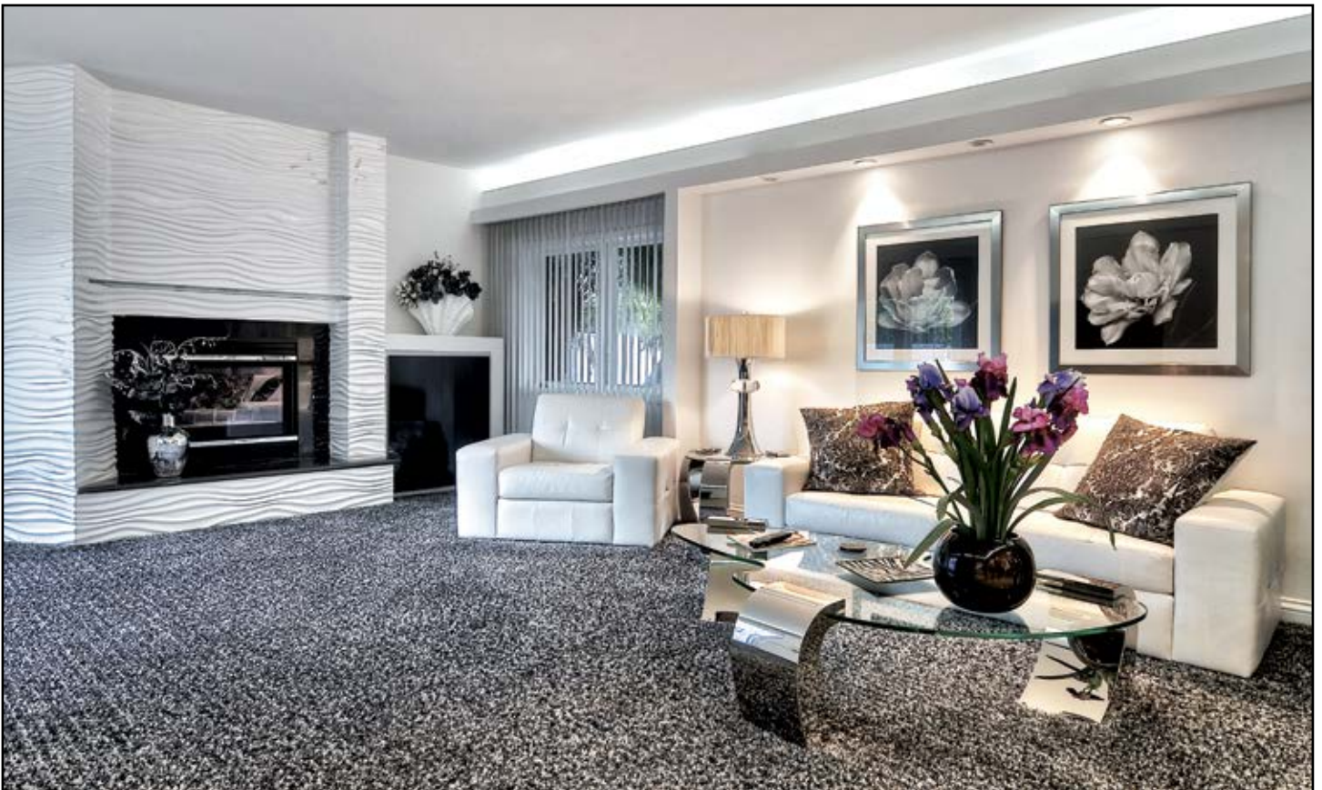
The Wave - Paint Grade