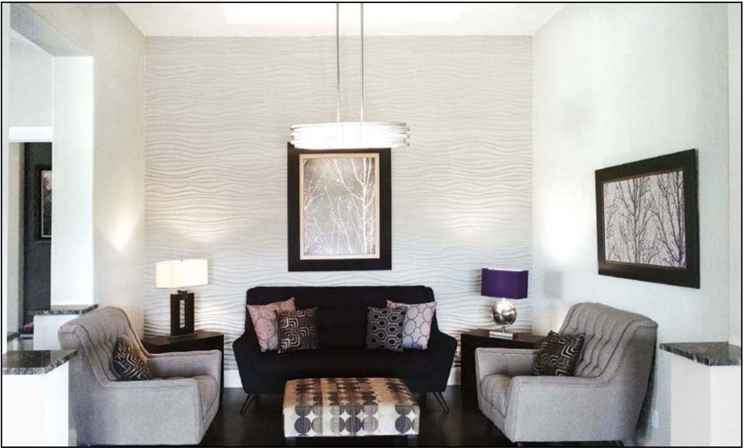
The Wave - Paint Grade