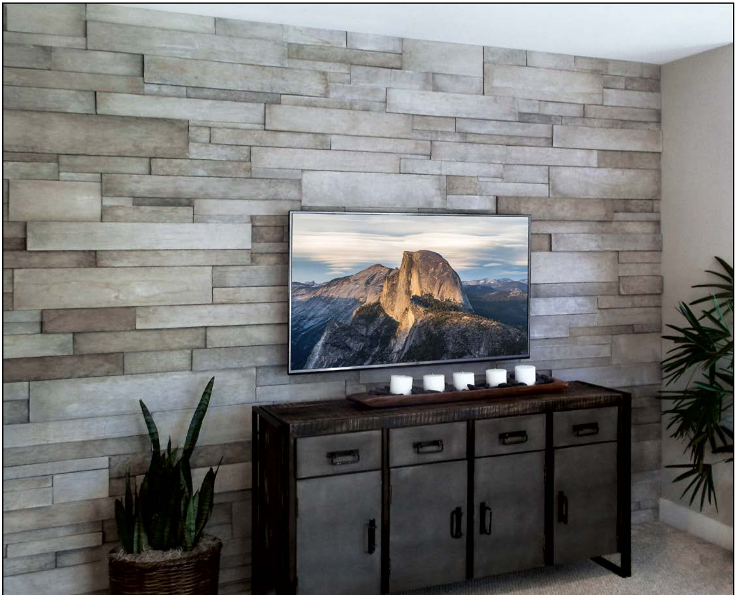
Industrial Ledge - Shale Grey

Apply the piece to the wall slightly above the desired position and work it in using a left-to-right motion until mortar squeezes from the perimeter and full-coverage adhesion is achieved. This process will also ensure enough excess mortar remains to fill any small gaps between stones and to help bond the individual pieces to each other. This will minimize the potential for moisture getting behind the stone. If too much mortar remains between the pieces, lift up the piece high enough to remove some of the excess mortar using a small tuck point trowel or similar tool and then reposition.