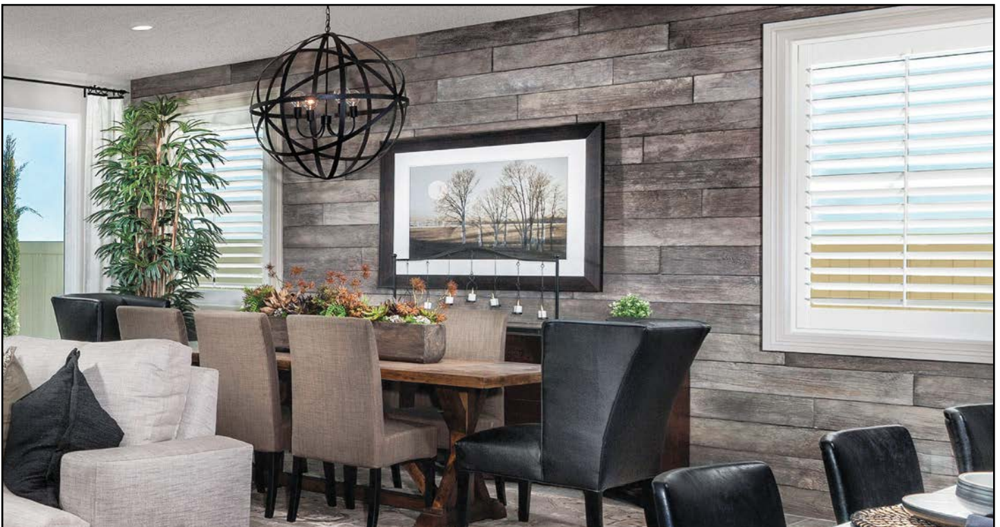
Barn WoodStone - Rustic Farmhouse

Note: WoodStone can be installed on the wall in either a horizontal or vertical pattern.